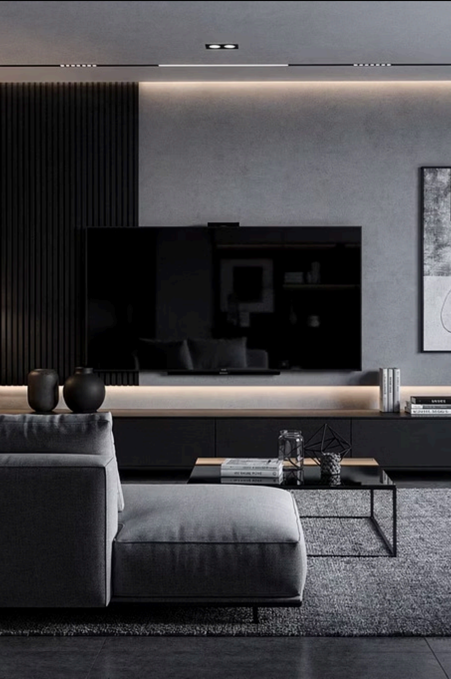
Illustration: The Owner's Design